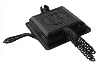
Griswold waffle iron patented in 1908